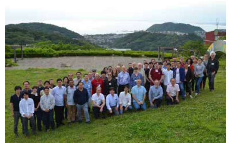
14th IACHEC meeting @ Shonan