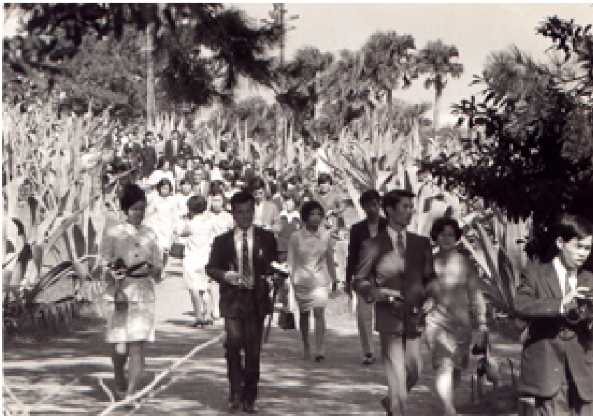
A scene of “Kodomo no kuni” just near this hotel