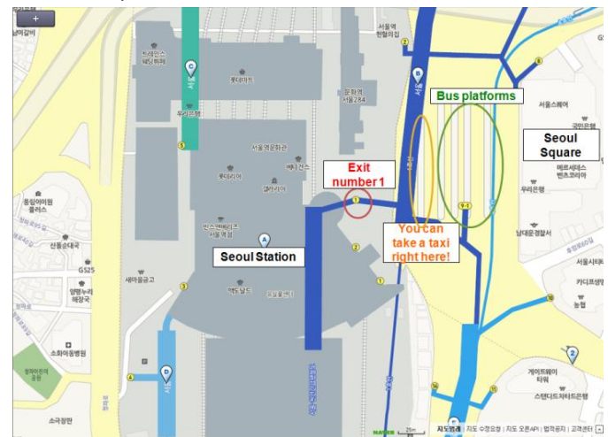
Figure 2. The map near the Seoul Station]

After you get off the Seoul Station, you should get out to the exit number I (See Figure 2). Then, you can see the number of bus platforms and buildings. If you see the building named Seoul Square, then you are in the right place. In front of the Seoul station, there are many taxies waiting you. The taxi platform is before the bus platforms.